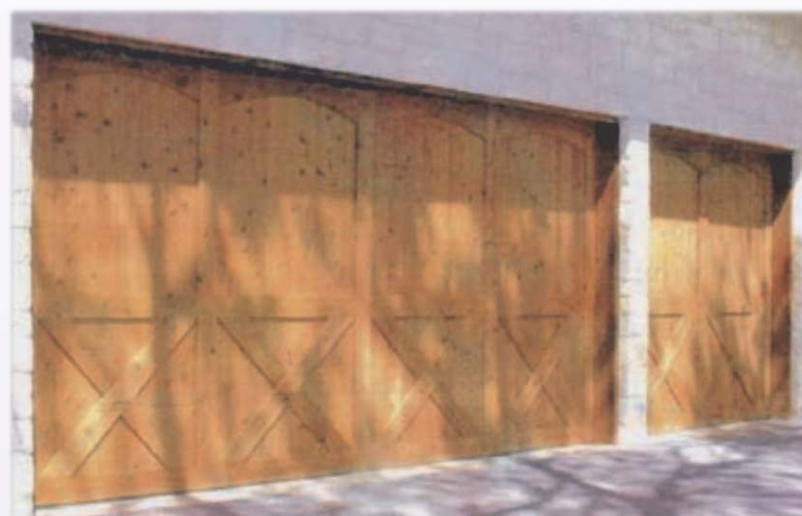
CW 133 with Arch